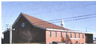
775 Topsail Road